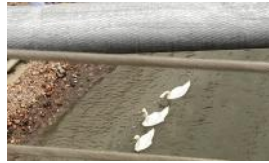
SWANS IN THE THAMES RIVER