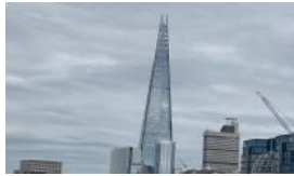
THE SHARD, LONDON'S TALLEST BUILDING