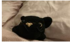
GENERAL VELVET IS IN LONDON, AT CALEDONIAN ROAD