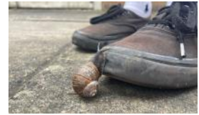
A SNAIL IS CLINGING ON TO ETHAN'S SHOE